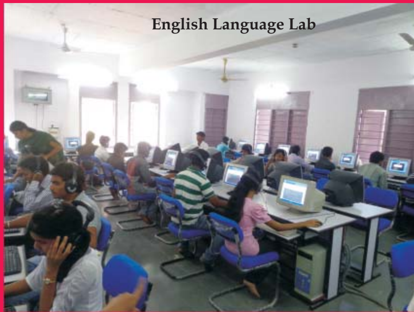
English Language Lab

The Department of English has latest Multi-Media Computer Lab loaded with latest software to conduct language course and soft skills courses. The Department of English conducts "Soft Skills and Communication Skills" Classes and trains students from all streams in interview skills & Group Discussions and prepares them for the Job Market.