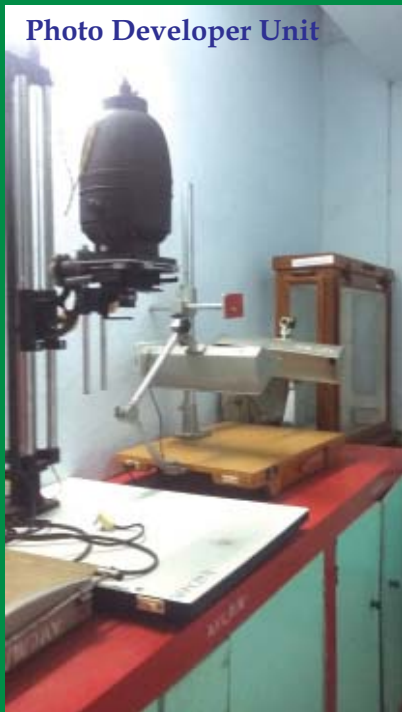
Photo Developer Unit

A separate research centre has been established with necessary research equipment and latest computers with net facility. Both faculty and students are encouraged to attend seminars, workshops and conferences. The Physics, Chemistry and Botany departments are recognized as research centres by Osmania University. Students from the Department of Physics have presented research papers in International conferences like COSPAR, Indian Science Congress, IITs, NITs etc.