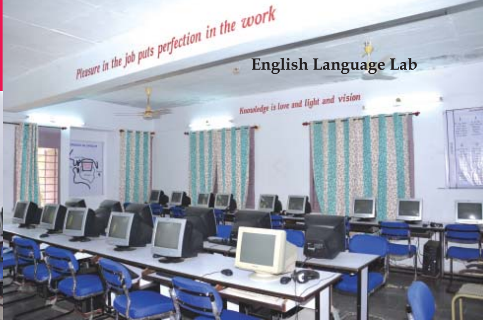
English Language Lab

The Department of English has latest Multi-Media Computer Lab loaded with latest software to conduct language course and soft skills courses. The Department of English conducts "Soft Skills and Communication Skills" Classes and trains students from all streams in interview skills & Group Discussions and prepares them for the Job Market.