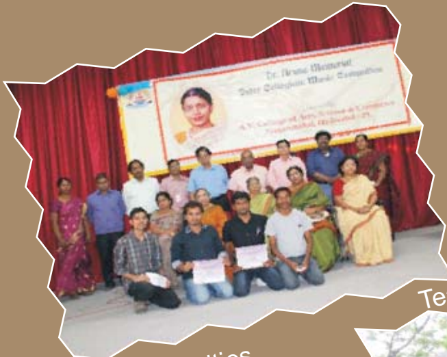
Dr. Aruna Memorial Music Competitions