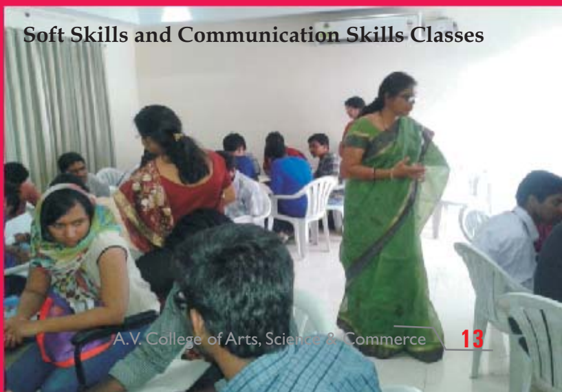
Soft Skills and Communication Skills Classes